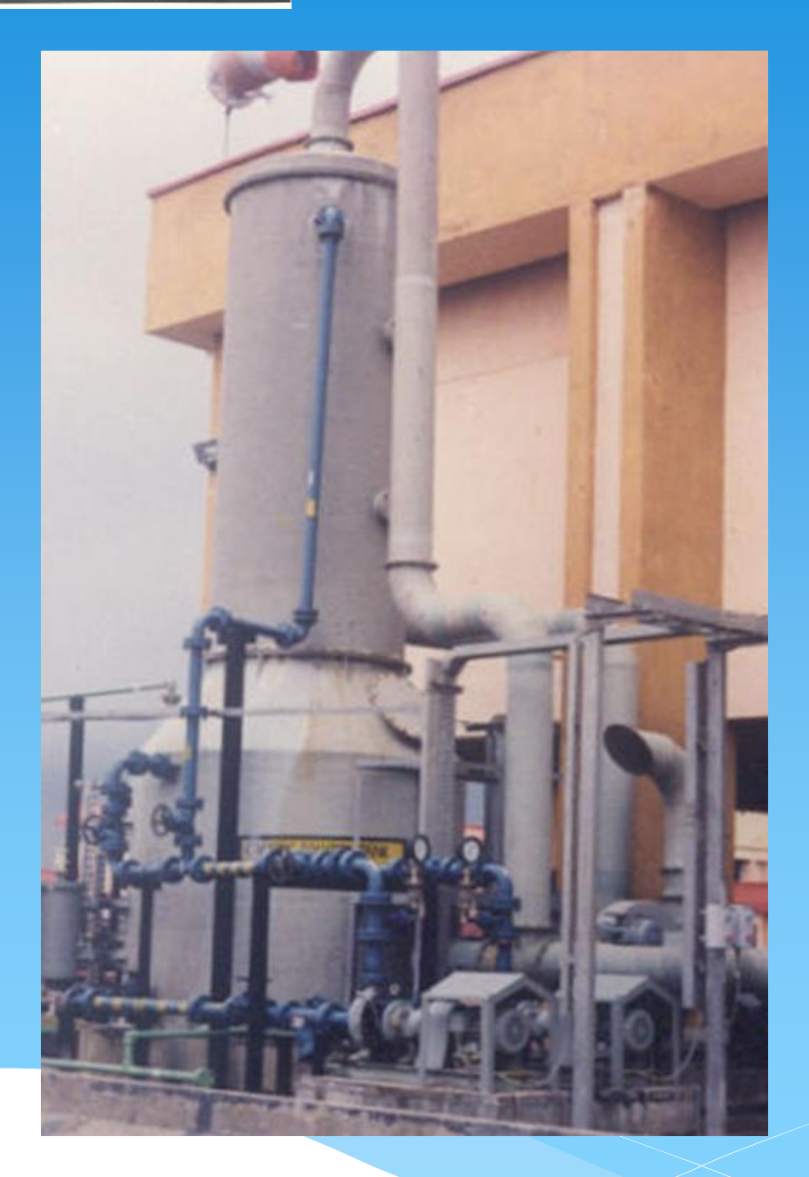
CHLORINE GAS LEAK DETECTOR ABSORPTION SYSTEM