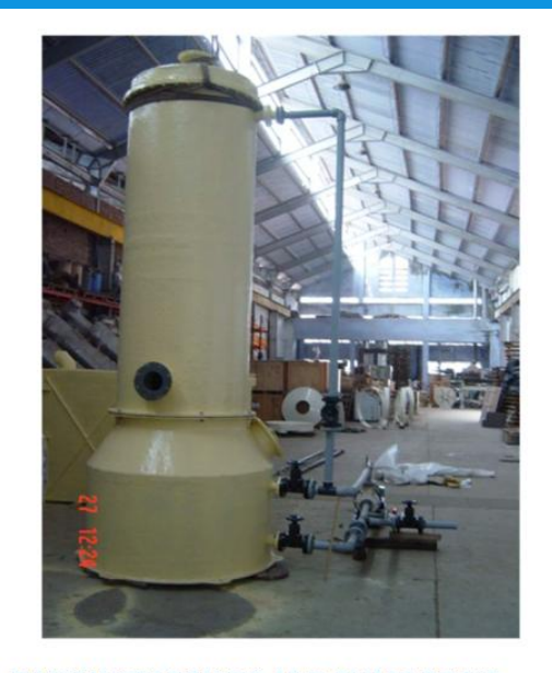
TANK WITH TOWER AND PUMP BEING TESTED IN FACTORY